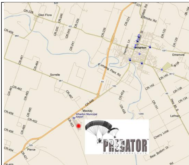
The Wharton Airport is just about 4-miles south - past the city of Wharton - on Hwy 59